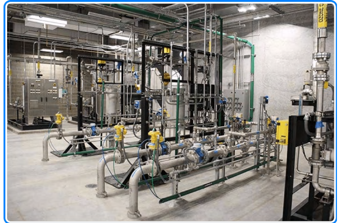
Ozone is mixed with side stream water and injected into the basins for disinfection in these ozone gas manifolds.

AE2S configured the architecture so the servers are in one building and housed under one System Platform galaxy. While this provides congruent standardization, each department is now responsible for their own assets. Each of the three System Platform Operations Management Interface view applications has features that are unique for each department, too.