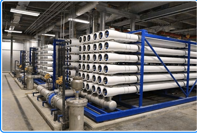
High-capacity reverse osmosis water treatment plant.