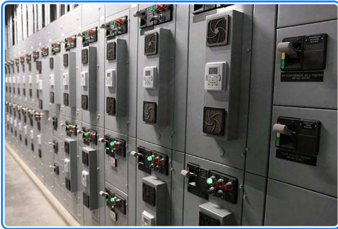
Grand Forks Water Treatment Plant

Together, GFRWTP, WWC, and WWT make up the City of Grand Forks Water* Department. While much of the work focused on the flagship treatment plant project, both WWT and WWC also received software system upgrades. These software upgrades have now allowed the operators to have remote control access to these facilities. Along with the software upgrades, the 69 remote collection sites were converted from an antiquated radio system to a new cellular-based telemetry system.