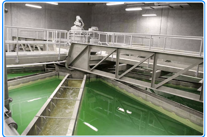
Contact basin where water coming in is being mixed with lime and chemicals for softening and to settle out the solids.

“The mobile app allows us to see who on the team is looking at the alarm, talk with each other, and respond. Overall, the remote alarm software and mobile app are a big improvement from operators sitting in a control room communicating via the phone or radios,” commented Aamold, an industry veteran with 30 years of experience with the Grand Forks Water Department.