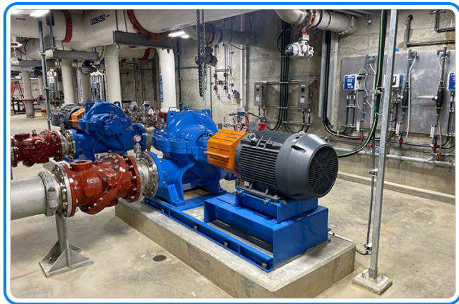
CVRD's new water treatment plant has a raw water pump station that pumps water from Comox Lake. The SCADA system monitors four 150hp pumps, level, pressure, flow, turbidity, UVT, pH and temperature.

McCauley received the green light to proceed with switching alarm notification software companies. He was familiar with WIN-911 software from his previous work at other regional districts and saw the myriad benefits it provides.