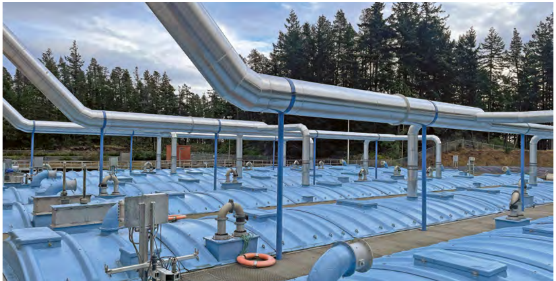
Figure 2. The Comox Valley Regional District's bioreactors are just one of the many pieces of equipment its SCADA system monitors.